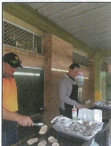
Father's Day Breakfast