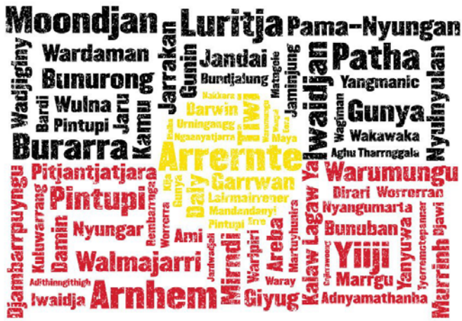
Our Languages Matter -Naidoc 2017-