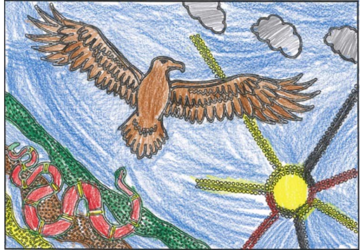
Primary Poster competition