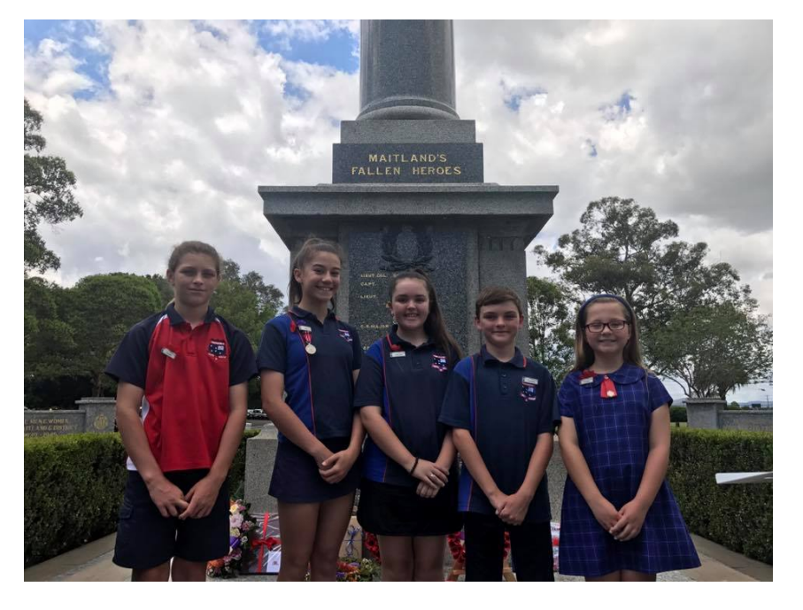
Remembrance Day 11th November 2017